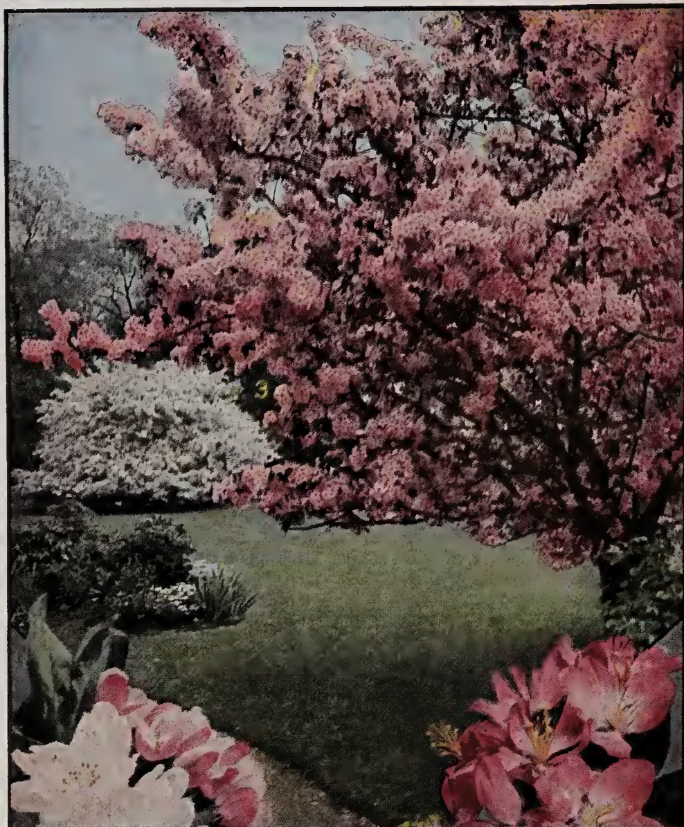
Oriental Flowering Crab

There is a lure, mystery, and secret thrill embodied in growing these wonderful, fragrant Oriental flowering trees. These "aristocrats" are indescribably beautiful when planted in groups of four to six, also as single specimens on lawns, and as background for shrub borders. They cannot be too highly recommended as they are perfectly hardy everywhere. In addition to the lovely flowers in all colors, they also have beautifully colored fruit which attracts the birds.